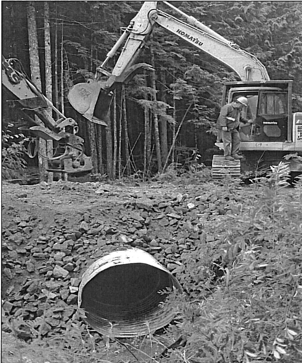
Picture 3: Installation of Culver for Recreation Area Road Drainage.