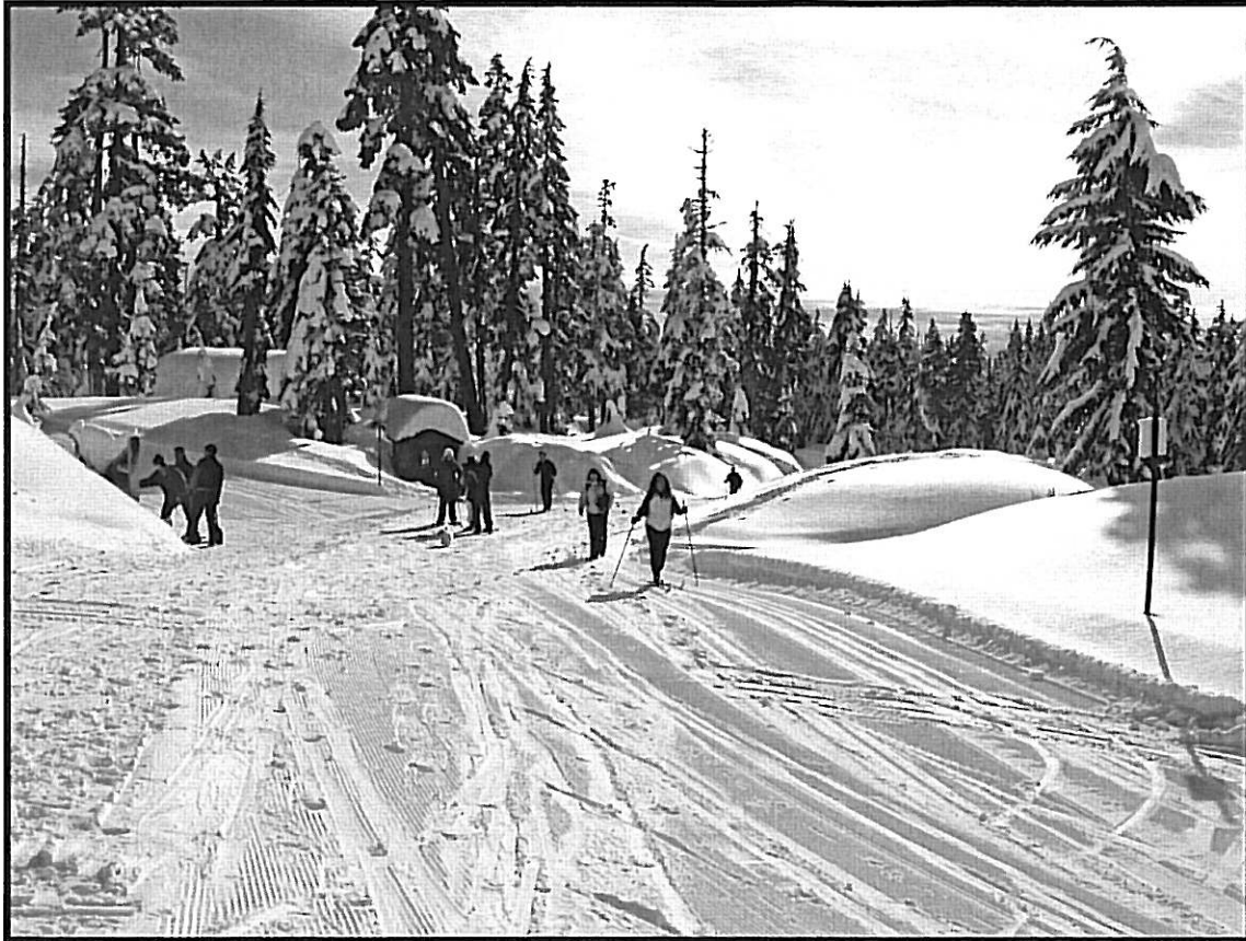
Picture 1: Trailhead of Dakota Ridge Winter Recreation Area - Winter '08.