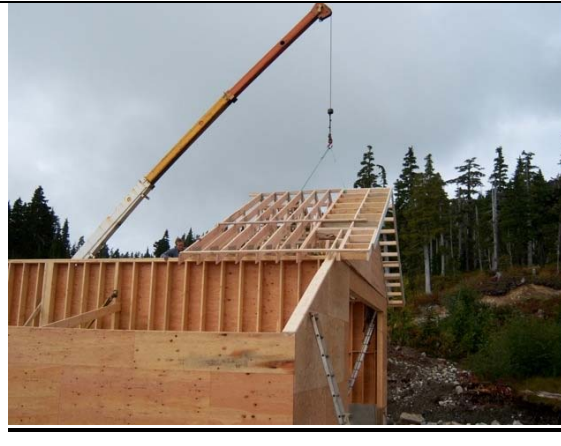
Roof trusses being put in place.