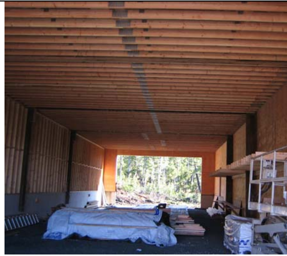
Interior of Maintenance Building

The interior of the building is ideal for working on multiple machines.