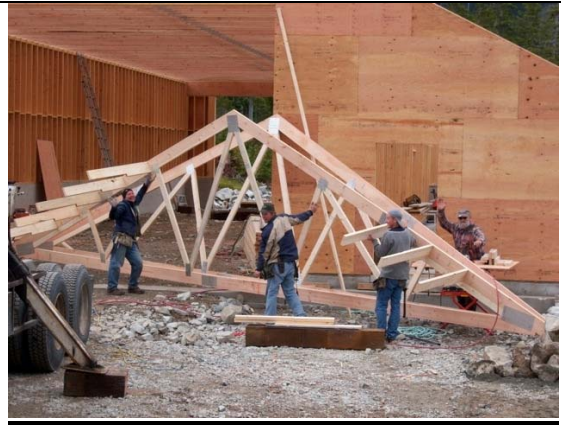
Roof trusses were pre-engineered and delivered via Lance Karsten's crane truck.