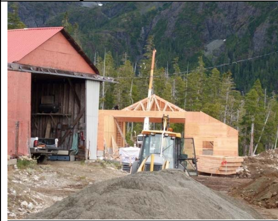
Only a large crane could place the roof trusses in place.