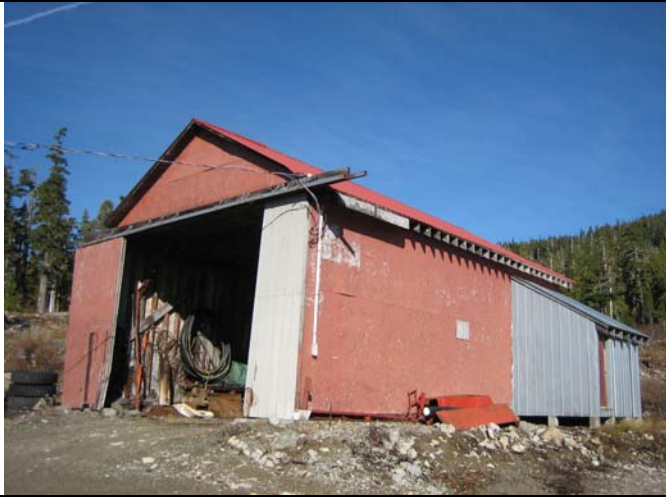
Old Maintenance Building.

The old maintenance building was in very poor condition and was unable to permit service of Mt. Cain's equipment.