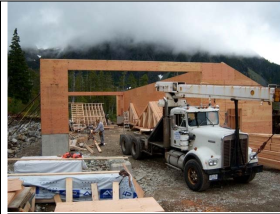
Following construction of the building frame, installation of the roof trusses was the next step.