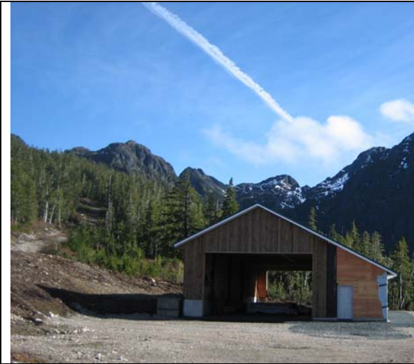
Completed Maintenance building

The new Maintenance building was completed in 2010, on schedule and on budget.