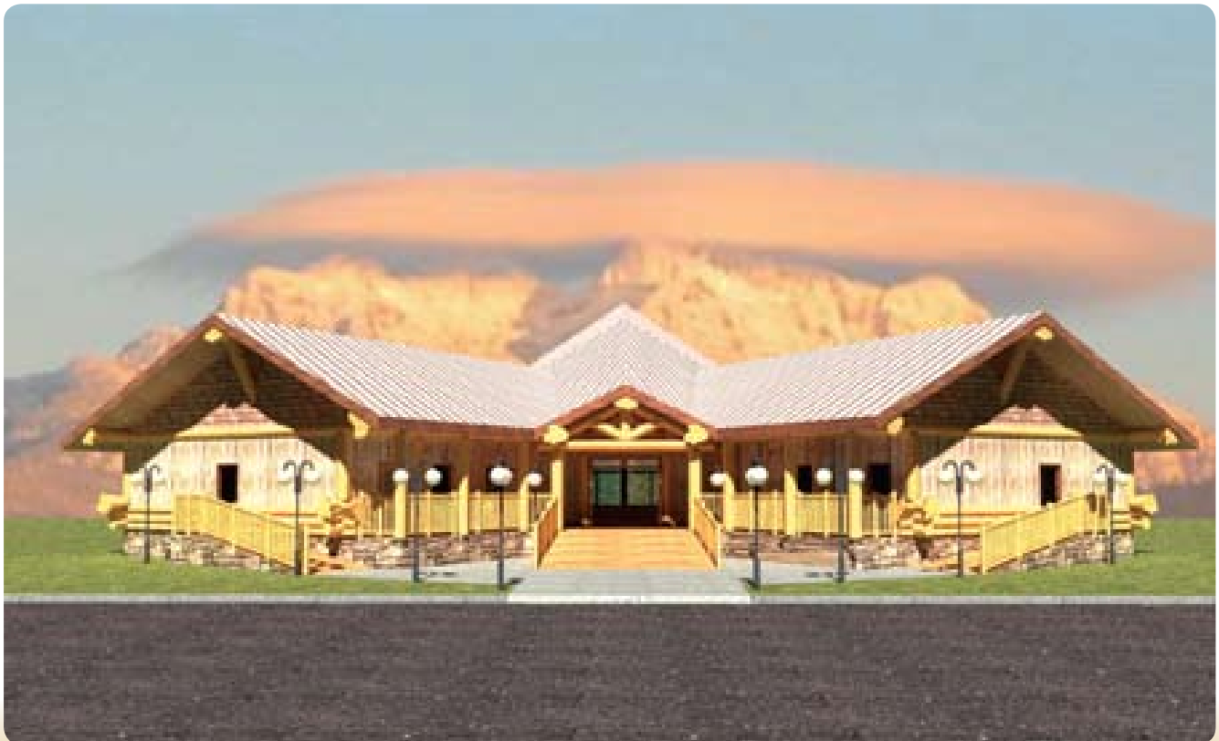
Artist impression of The Gateway Visitor Centre for the Alberni Valley and Pacific Rim Region

with local products and labour, and will be constructed on the site of the current visitor information centre. Inside will be First Nations' interpretive displays,