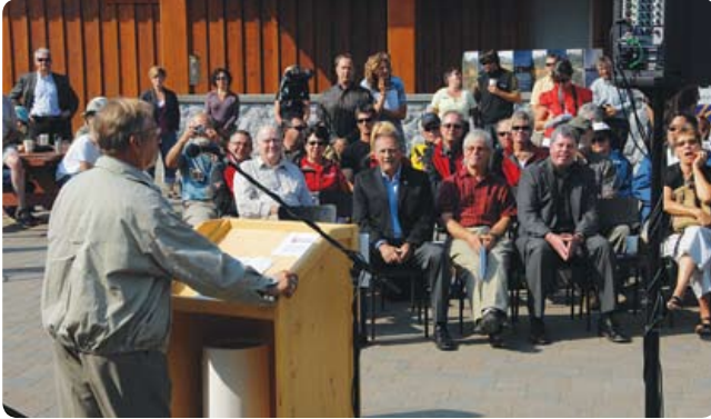
ICET Chair Mayor Barry Janyk at the Vancouver Island Mountain Sports Centre Federal Funding Announcement on August 6, 2009

The Vancouver Island Mountain Sports Centre will be a unique multifunctional building. The Centre will offer meeting and video rooms, training facilities with fitness equipment and space for a sport science lab, equipment storage and maintenance rooms as well as modest accommodations with cooking facilities designed to meet the needs of athletes as well as school and other community groups.