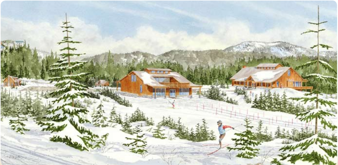
Artist impression of Vancouver Island Mountain Sports Centre cross country complex

An independent economic impact study estimates that all construction spending will generate an economic output of more than $7 million, with an additional $1.3 million per year province-wide once the Centre is operational. Additional government revenue generated by the