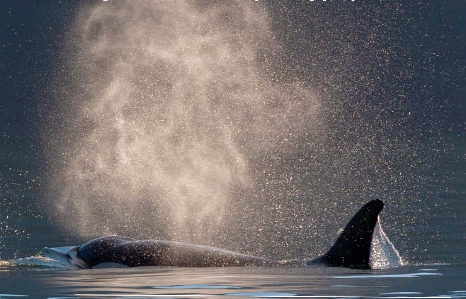
Sunrise over Musgamagw Dzawada'enuxw territory.

As we work toward inclusive and resilient economic futures, we do so with a deep appreciation for the histories, contributions, and rights of the Kwakwaka'wakw/Bakwam'kala, Nuuchaanul, Ey7á7juuthem, Ligwilda'xw, Pəntl'áč, She shashishalhem, Hul'q'umi'num', diitiidʔaatx, SENĆOŦEN, Skwxwú7mesh, Lekwungen, and T'Sou-ke speaking peoples.